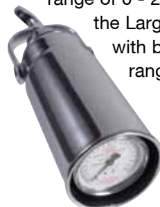
Standard Size Speedy

A pressure gauge with a moisture measurement range of 0 - 20% is fitted as standard to both the Large and Small vessels, but gauges with both wider and narrower moisture ranges are available.