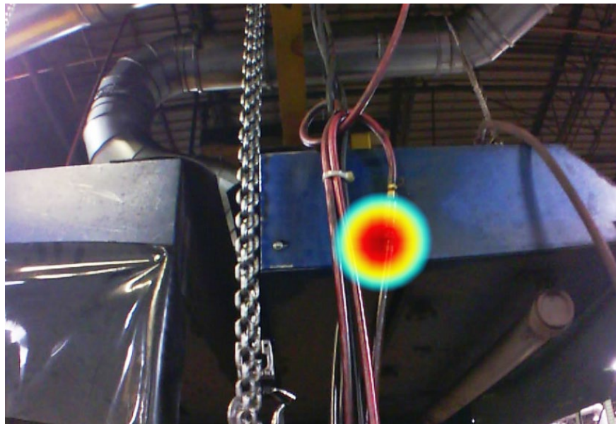
Images taken with the ii900 Sonic Industrial Imager in an industrial environment.

Fluke. Keeping your world up and running.®