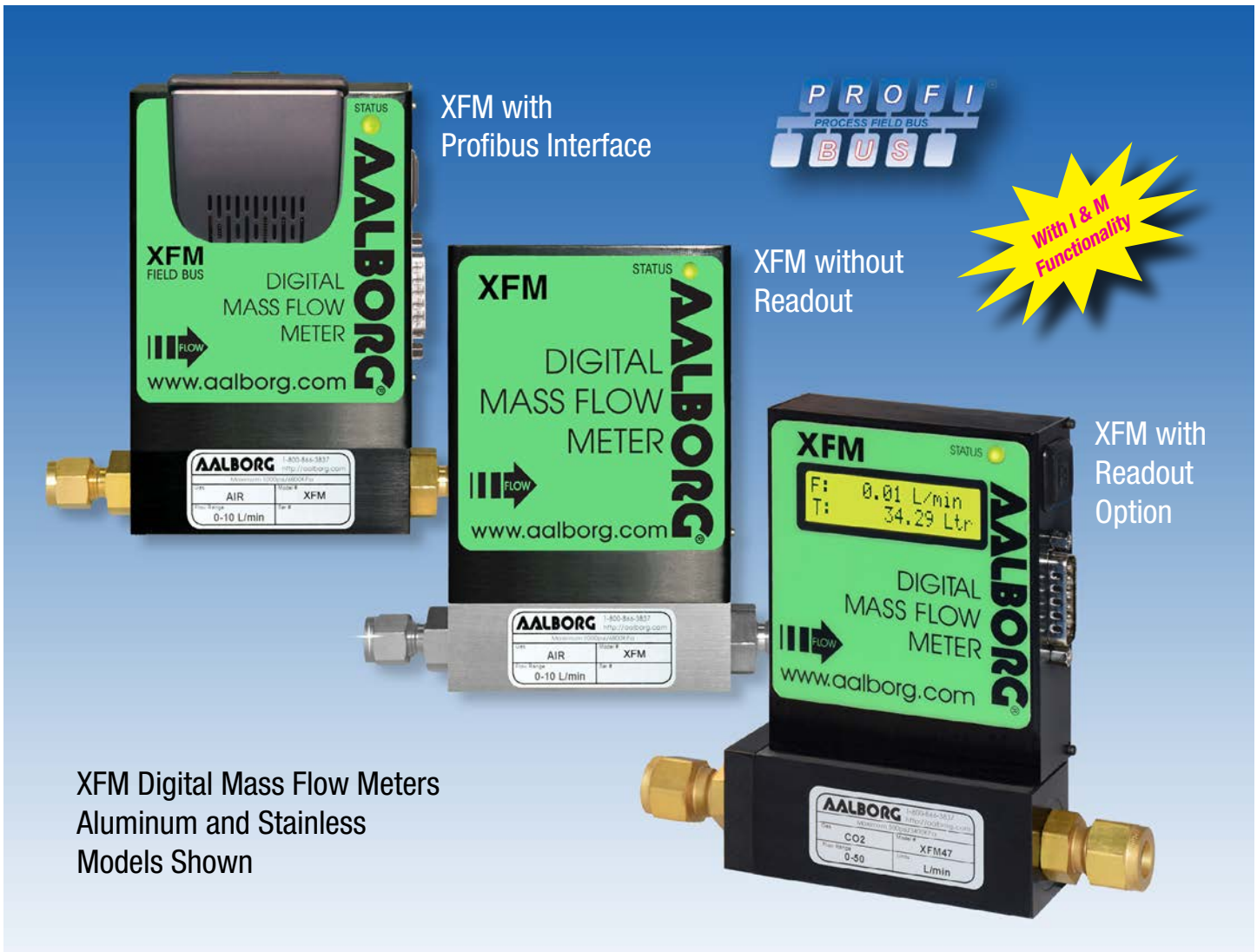
XFM Digital Mass Flow Meters Aluminum and Stainless Models Shown