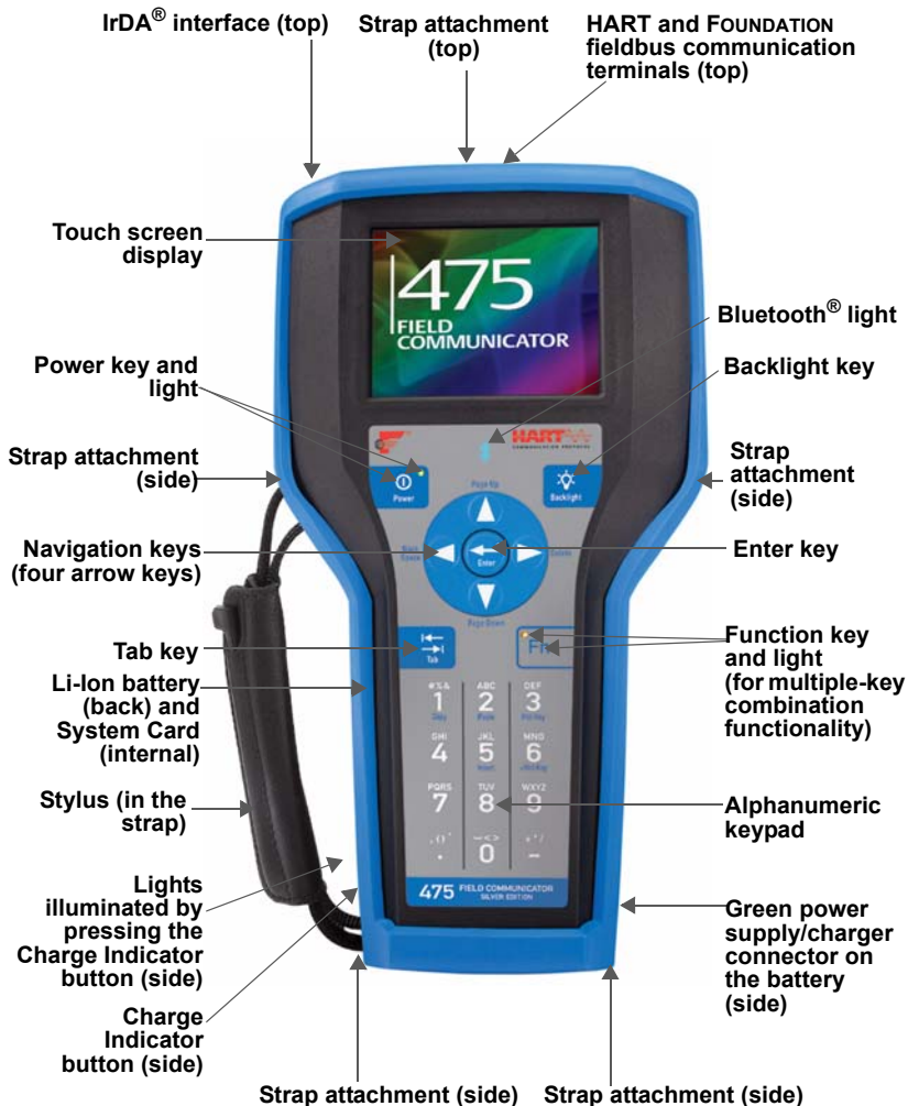
Figure 1. 475 Field Communicator with the Protective Rubber Boot