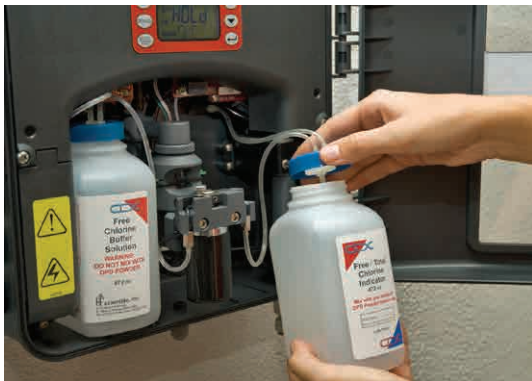
Changing the Reagents

The Residual Chlorine Monitor shall be able to measure free or total chlorine using the DPD colorimetric method. The Chlorine Monitor shall have a measurement range of 0-10 mg/l. The Chlorine Monitor shall include the power supply, sensor and display in one NEMA 4X (IP66) corrosion resistant enclosure. The Chlorine Monitor shall have readings consistent with laboratory and portable Chlorine Photometers. The Chlorine Monitor shall have standard 4-20 mA outputs and RS-485 with Modbus Protocol. The 4-20 mA output shall be standard or reversible. The Chlorine Analyzer shall have a removable sample cuvette. The sensor shall have a clear view to the optical chamber allowing viewing of the sample and reaction of the reagents, before, during and after a reading. Accuracy shall be \pm 5\% with a resolution of 0.01 mg/l for the range of 0-6 mg/l and \pm 10\% with a resolution of 0.01 mg/l for the range of 6-10 mg/l. The Chlorine Monitor shall have a user selectable cycle time between 110 seconds and 10 minutes (optional 60 seconds to 10 minutes). The Chlorine Monitor shall be capable of 30 days of unattended operation. The Chlorine Monitor shall take a zero reading before each reading to compensate for color in the sample. The Chlorine Monitor shall have microprocessor based technology. The Monitor shall have two user selectable alarm relays.