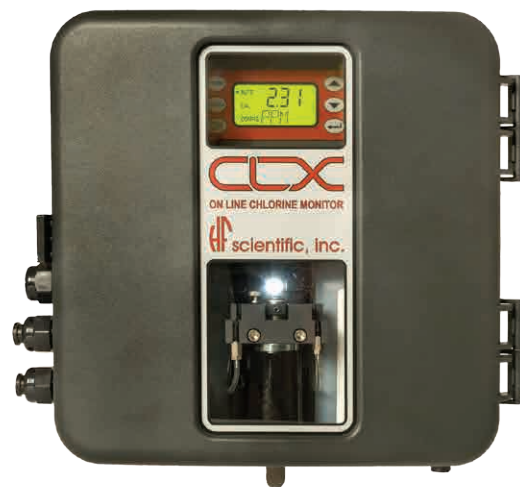
Changing the Sample Cuvette