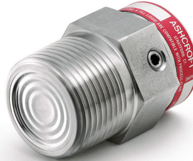
330 Threaded Seal