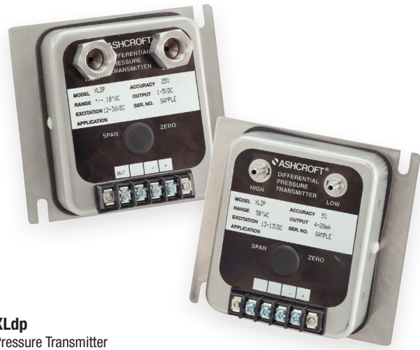
XLdp Pressure Transmitter