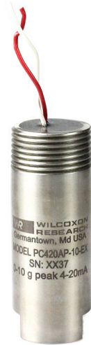
Table 1: PC420Ax-yy-EX model selection guide