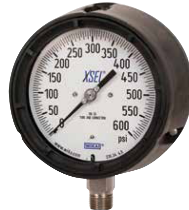
Bourdon Tube Pressure Gauge Model 232.34

Medium: max. +212°F (+100°C) (See Note 1 on reverse)