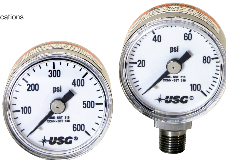
Model P1521 Center-Back Mount (CBM) and Lower Mount (LM)