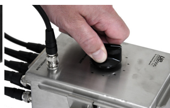
Step 4 - Switch through the points and take your reading