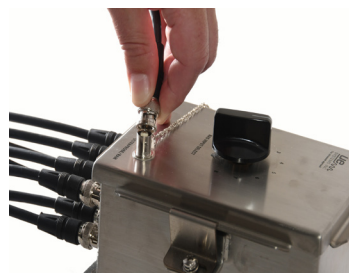
Step 2 - Connect the sensors to the switch box