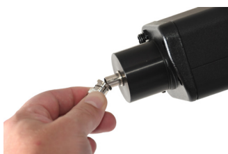
Step 3 - Connect an Ultraprobe to the box