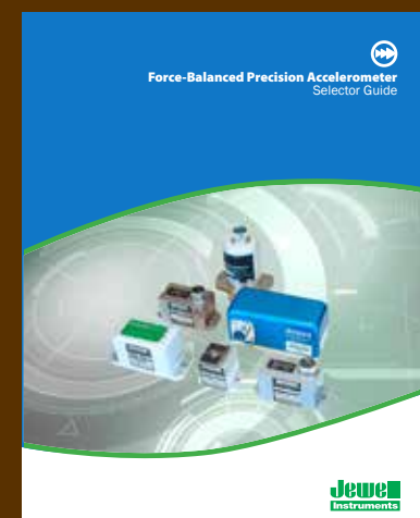
Force-Balanced Precision Accelerometer Selector Guide

Jewell Instruments is a world leader in the manufacture and distribution of panel meters, avionics components, inertial sensors, and precision solenoids. From sales and design, manufacturing and testing, and delivery and support, Jewell Instruments offers complete customer care and engineering expertise. We also offer two, fully modernized manufacturing facilities, one in Manchester, New Hampshire and one in Barbados, West Indies to handle the most stringent manufacturing requirements with a cost-competitive advantage.