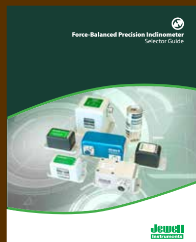
Force-Balanced Precision Inclinometer Selector Guide