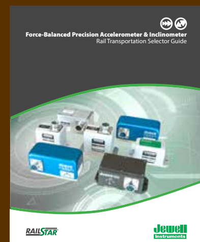
Rail Transportation Selector Guide