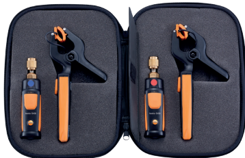
Refrigeration Smart Probe Kit: 0563 0002