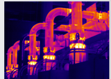
MultiSharp™ Focus produces an image focused throughout the field of view