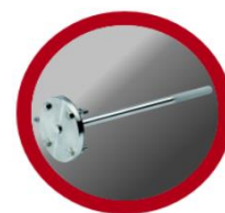
Gas sampling probe LD unheated, with in-situ sintered metal filter