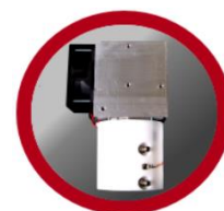
Thermoelectric gas cooler Peltier type