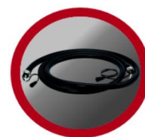
Gas sampling line Teflon, heated with temperature regulation