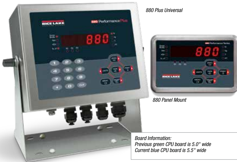
880 Plus Universal