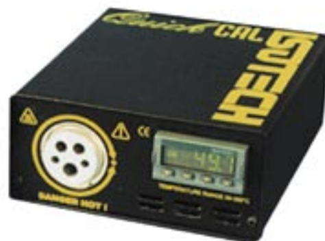
550, High-Temp Model