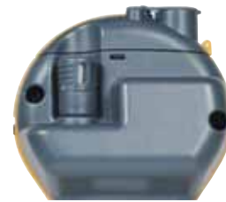
Quikstick ST POL78751, standard with all MMS2 kits and with the same performance as the standard Quikstick. A Quikstick ST can remain connected to the MMS 2 while using the pins.

Readings from multiple Hygrosticks can be taken and recorded with ease. Humidity readings can be taken with the use of humidity sleeves or humidity box. Hygrosticks, not Humisticks, should be used for this test.