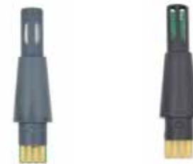
Hygrostick part number POL4750, for high moisture applications.