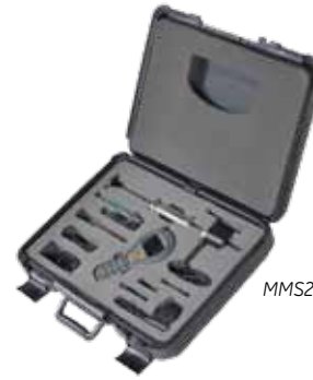
MMS2 Hard Carry Case Kit