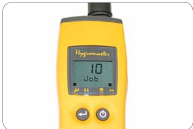
Assign job numbers to data