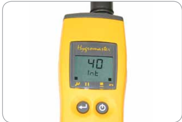
Set interval 1 minute to 24 hours