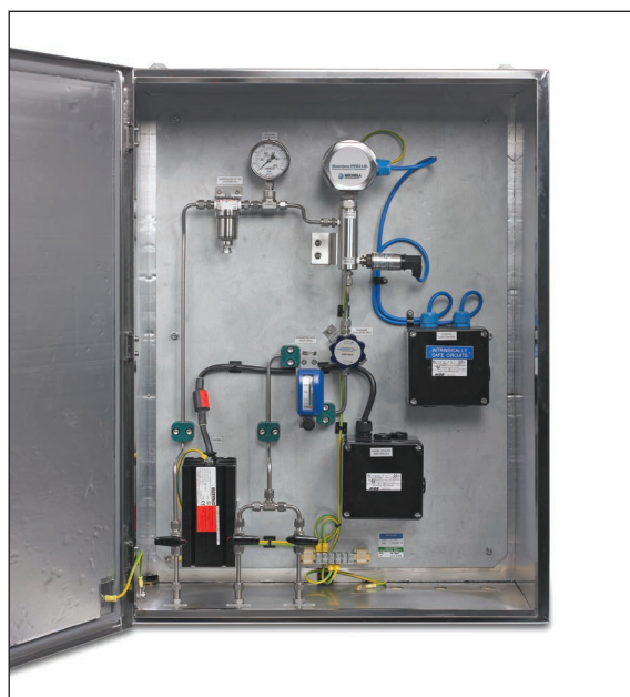
Promet I.S. Sampling system