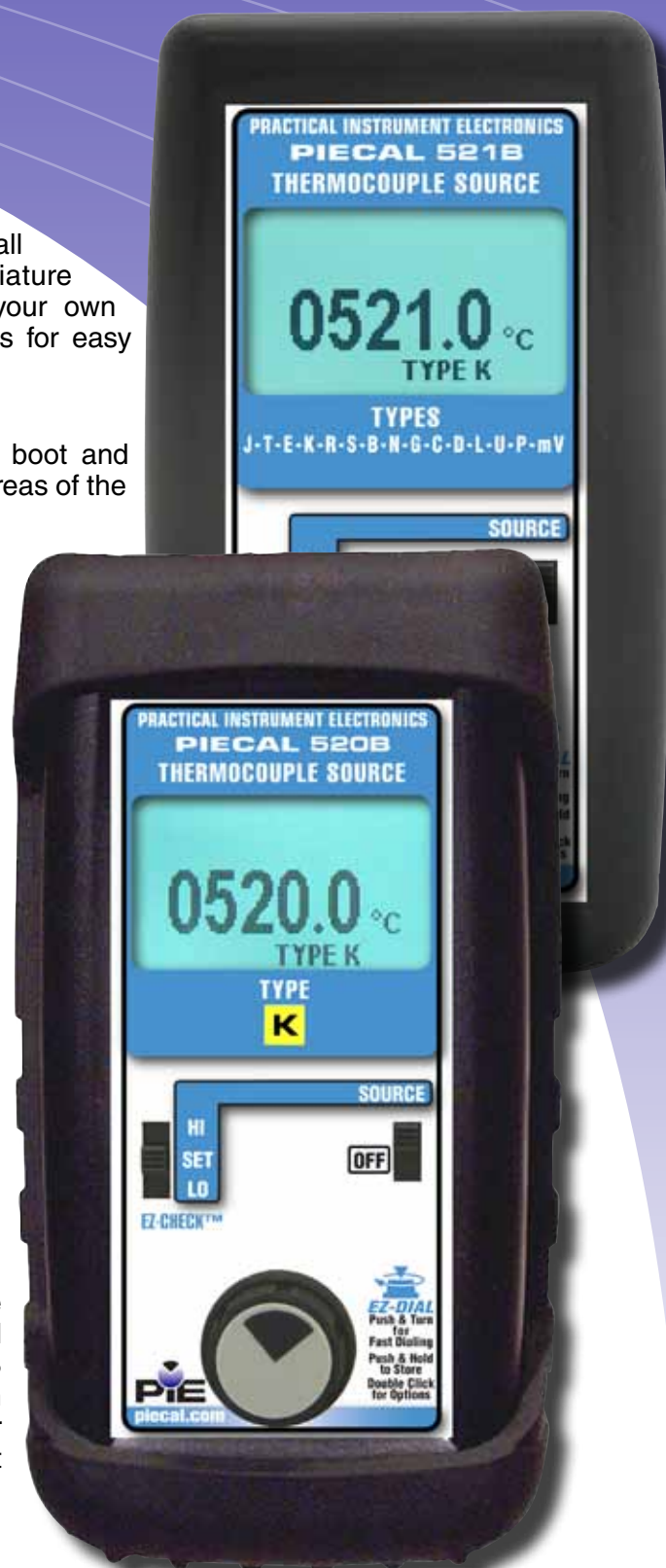
Actual Size (Shown with optional boot)