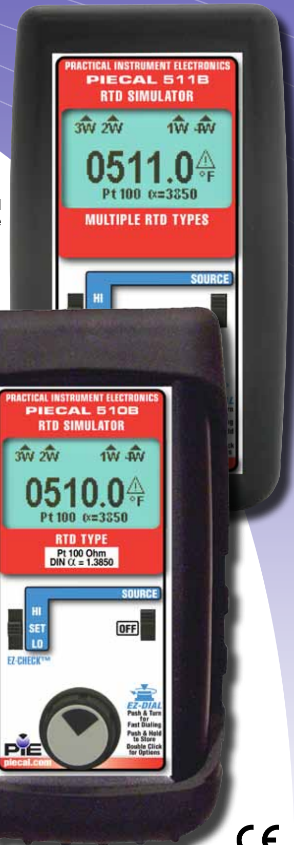
Actual Size (Shown with optional boot)

* PIECAL Calibrators are not manufactured or distributed by Fluke Corp or Altek Industries Inc, manufacturers of Altek Calibrators.