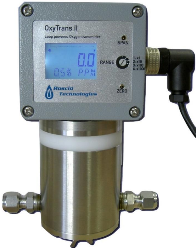
Figure 1: Oxytrans-II