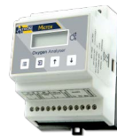
Microx Oxygen Analyser