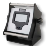
GazTrak Portable oxygen & moisture measurement