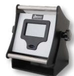
GazTrak Portable oxygen & moisture measurement