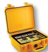
Yellow Box Portable O 2 Analyser