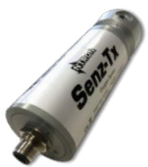
SENZTX Oxygen Transmitter