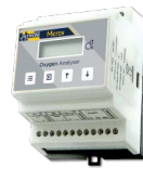
Microx Oxygen Analyser