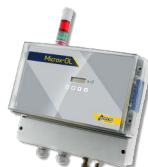
Microx-OL Online Oxygen Analyser