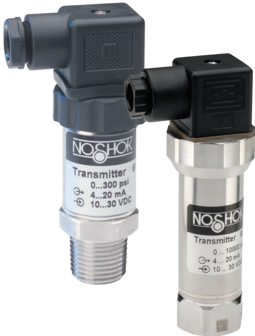
High pressure model