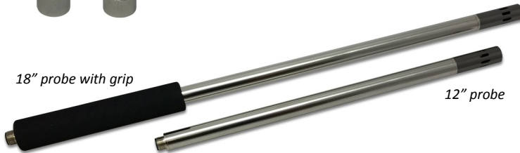
18" probe with grip