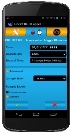
Selectable record rate