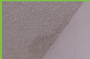
Unexpected moisture intrusion in a ceiling.

When potential wet spots in exterior walls and roofs are identified, follow up with an inspection inside the building, to further refine the outdoor findings. Inside inspections can also independently pinpoint moisture in ceilings and walls caused by leaks, water pipe breaks, fire-sprinkler discharges or other water-producing events. Fast action with a thermal imager following a water-producing accident can identify which materials must be dried or replaced.