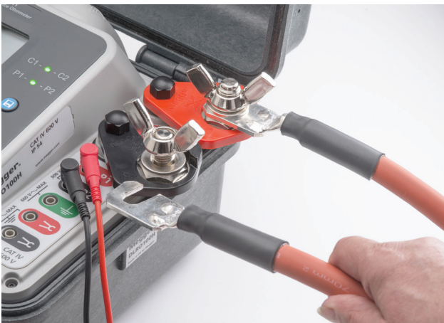
A new terminal adapter has been designed to enable the use of users own test leads.

DualGround™ capability with the DC clamp