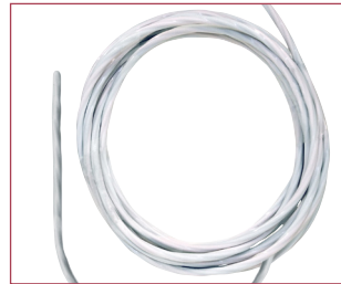
Flexible RTD Probe (FP)