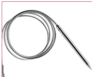
Stainless Steel Bendable RTD Probe (PT)