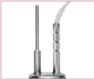
Rigid Transitional Diameter Probe (TD)

The HiTemp140X2 data logger series is compatible with the latest version of the MadgeTech Software. This allows for simple starting, stopping and downloading of collected data. Once the readings have been downloaded to the software, it can be viewed in graphic, tabular, and summary form for easy analysis, as well as the potential to be exported into Excel for further calculations.