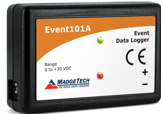
Event101A Event Data Logger with a 10 Year Battery Life