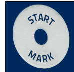
Close-up of the start/mark switch