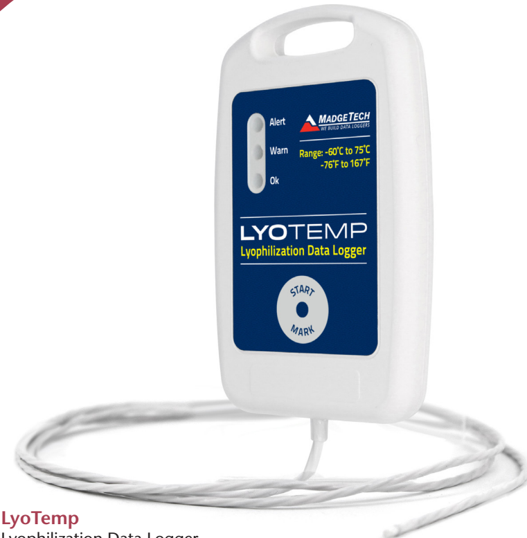
LyoTemp Lyophilization Data Logger

See MadgeTech's terms and conditions at www.madgetech.com