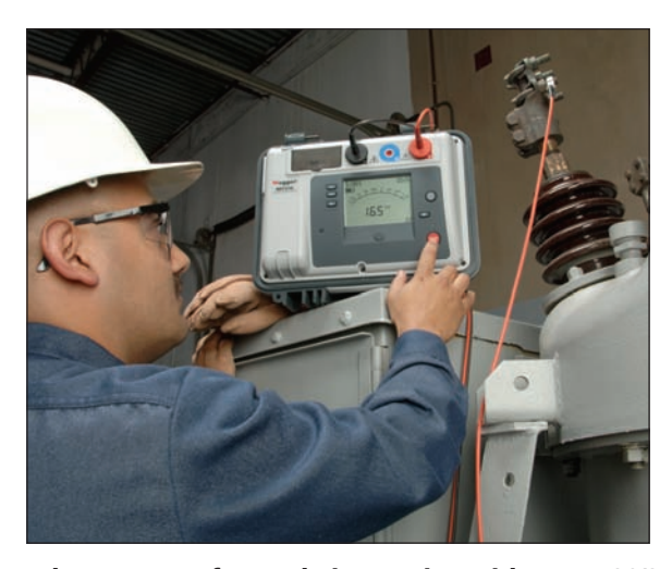
Delta wye transformer being testing with a MIT520/2