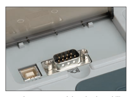
Extra data storage and download capability

Run more tests and save more test data. Download results using either an RS232 or USB style connection (MIT520/2 and MIT1020/2 only).