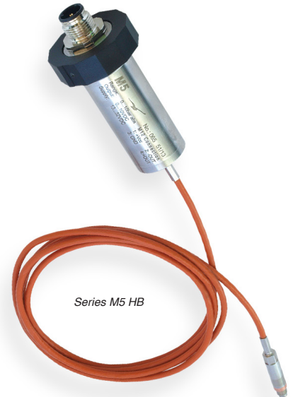
Series M5 HB