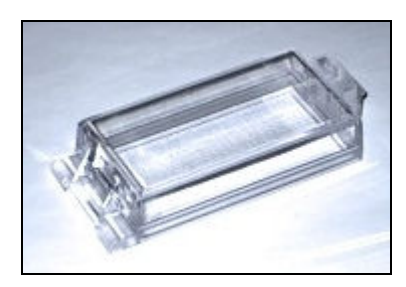
Model IPC splashproof cover

Model IPC Splashproof Cover is a rugged, impact resistant, clear lens that fits over a 1/8 DIN instrument to make it dust and water proof from the front of the panel. Sealing meets NEMA 12 (IP52) standards for water splash and dust protection when the hinged door is simply snapped in place. Sealing meets NEMA 4 (IP67) standards for hose-directed water when the hinged door is further clamped down with a provided plastic locking key.