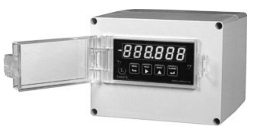
Box2 wall-mount enclosure with IPC splash-proof cover. Suitable for 1/8 DIN instruments up to 160 mm deep.

of clear silicone grease, or other approved sealant, to the mating groove to prevent any ingress of liquid and enable the cover to withstand steam cleaning.