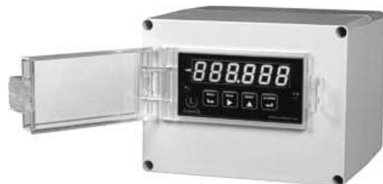
Box2 wall-mount enclosure with IPC splash-proof cover. Suitable for 1/8 DIN instruments up to 160 mm deep.

If the front panel of the instrument already provides environmental protection to IP65 / NEMA-4X from the front, such as the Laureate Series, then the entire instrument will be protected IP65 / NEMA-4X once it is installed in Model BOX1.