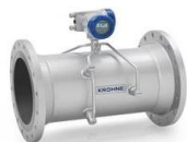
OPTISONIC 3400 Multi-purpose liquid UFM ± 0.3% of measured value Advanced diagnostics & converter