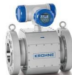
ALTOSONIC V12 Custody transfer 12-chord design for gas measurement