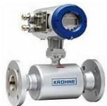
UFM 3030 3-beam inline liquid UFM ± 0.5% of measured value