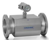
ALTOSONIC III Custody transfer 3-beam for light hydrocarbons