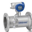
OPTISONIC 7300 Universal 2-beam for process ga ± 1% accuracy of measured valu