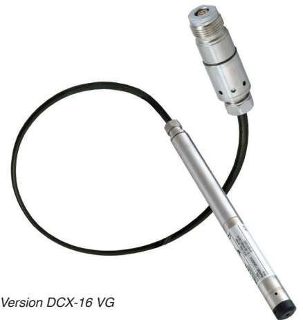
Version DCX-16 VG