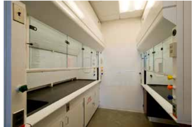
Fume Hoods are common in many types of labs and industries

A fume hood is a local ventilation device designed to eliminate or minimize exposure to hazardous fumes, dust or other airborne particulates. Basically, the fume hood provides an area where a technician can safely work with certain hazardous materials. The fume hood is designed to contain and vent all dangerous vapors and particulates away from the worker. A typical fume hood will undergo quality testing by the manufacturer, but it is also necessary to test the fume hood in its installed state and to periodically make sure the hood is performing correctly to limit human exposure to airborne hazards. ASHRAE 110-1995 is the current industry accepted standard for this testing procedure.