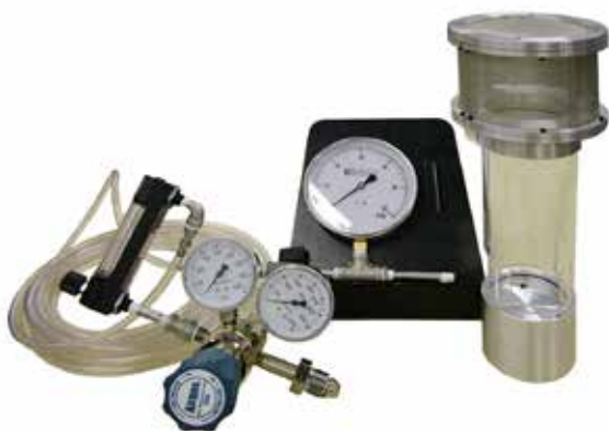
Kanomax Dif-Kit for Fume Hood Testing

Kanomax has delivered the best measurement solutions in its products and services that adapt precision measurement technology for fluids and particles. Kanomax product lines include anemometers, particle counters, dust monitors, and IAQ monitors. Kanomax is contributing to technological innovation and quality improvement for the processes of quality management, environment management, and technology development in the areas of environment, health, and energy, which are essential to sustain human well-being, as well as in other industrial areas including automobile, aerospace, semiconductor, electronics manufacture, heavy industry, steel, shipbuilding, pharmaceutical, biotechnology, food-processing, medical, construction, and civil engineering.