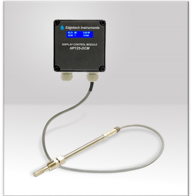
The HP125 Series Smart Probe