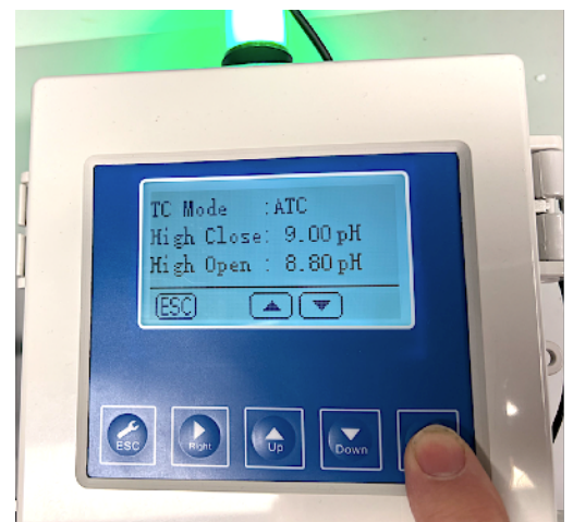
REVIEW CONTROL POINTS