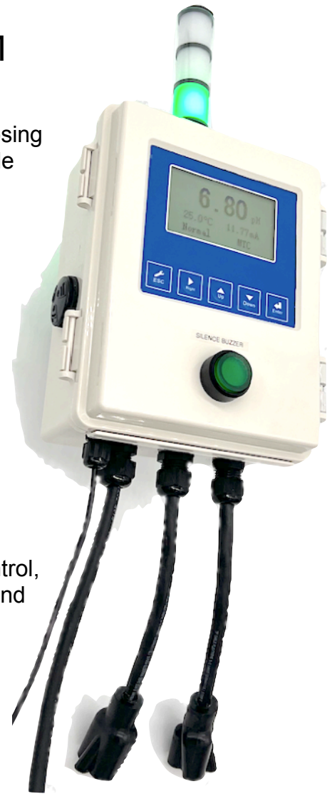
ACID PUMP BASE PUMP