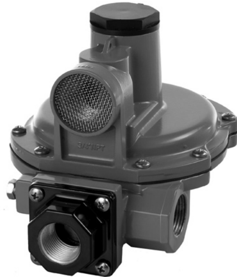
Figure 1. Type R642 Second-Stage Regulator