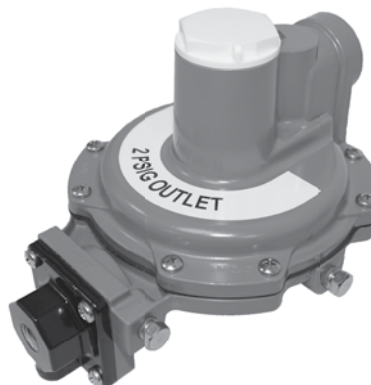
Figure 1. Type R632E Integral Two psig Service Regulator