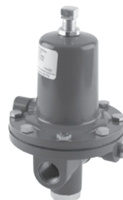
67C SERIES REGULATORS