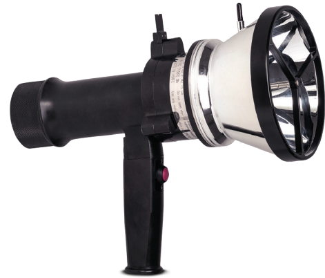
Rosemount™ Flame Simulator

To be fully secure against fire, flame detector self-testing is not enough. According to most local jurisdictional authorities and as required for SIL2 compliance, you need to test and ensure the integrity of your entire flame detection system at least once per year. That means performing a full system loop test from the detector, through the wiring to the controller, and up to the actual alarm notification. The only way to do so, without lighting a real fire, is with an external flame simulator.