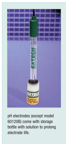
pH electrodes (except model 60120B) come with storage bottle with solution to prolong electrode life.