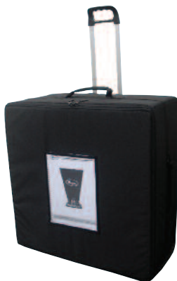
AFH2 Travel Case