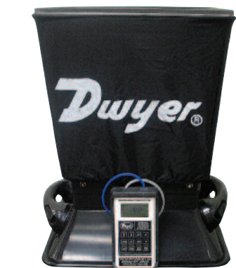
AFH2 with A-174 Low Flow Adapter