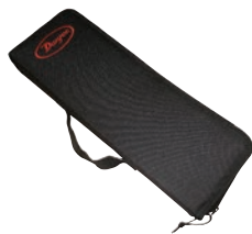
Soft Carrying Case Included with Every Unit