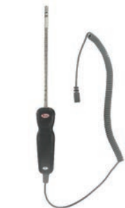
Replaceable Probe with Secure 6 Pin Adapter

AP1, Thermo anemometer air velocity & temperature probe with coiled cable UHH-C1, Soft carrying case