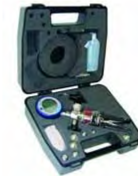
Hydraulic test kit